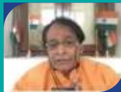
Shri Suresh P Prabhu Member of Parliament - Rajya Sabha India's Sherpa - G 7 & G 20